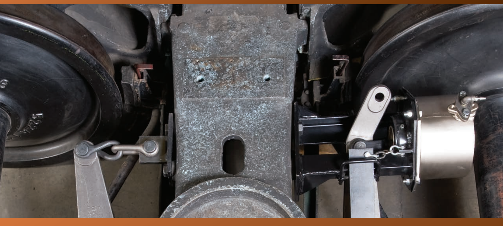
Precision-engineered for maximum reliability.